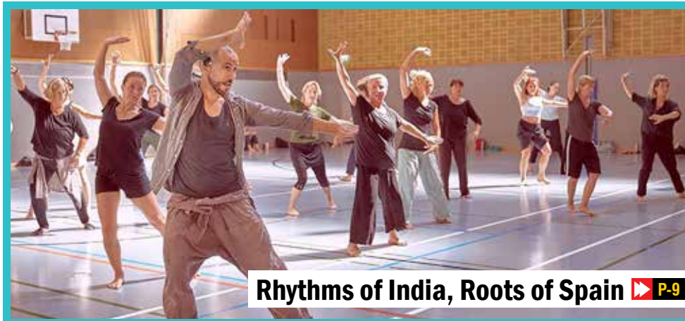
Rhythms of India, Roots of Spain ▶ P-9

Kalyan: The Bahujan Samaj Party (BSP) has raised serious concerns over the alleged injustice faced by Scheduled Tribe (ST) officials and employees in the Kalyan-Dombivli Municipal Corporation (KDMC). ▶ P-4